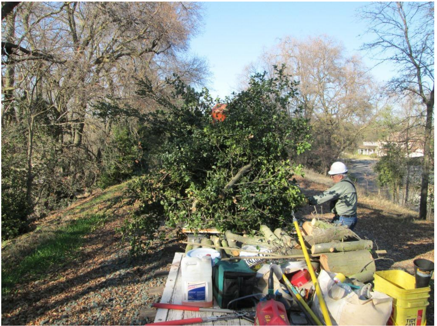
Joe teaches that tree a lesson!