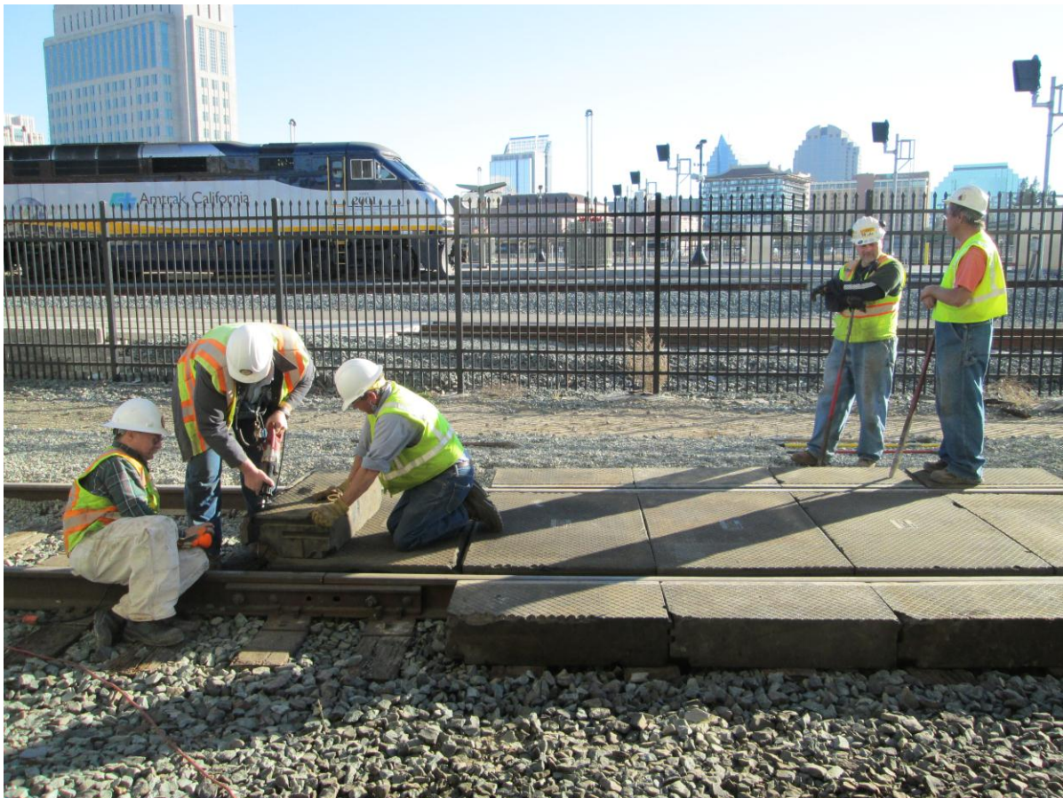
Cutting the panels was no easy task. Man, was it hard on the wrists and fingers!