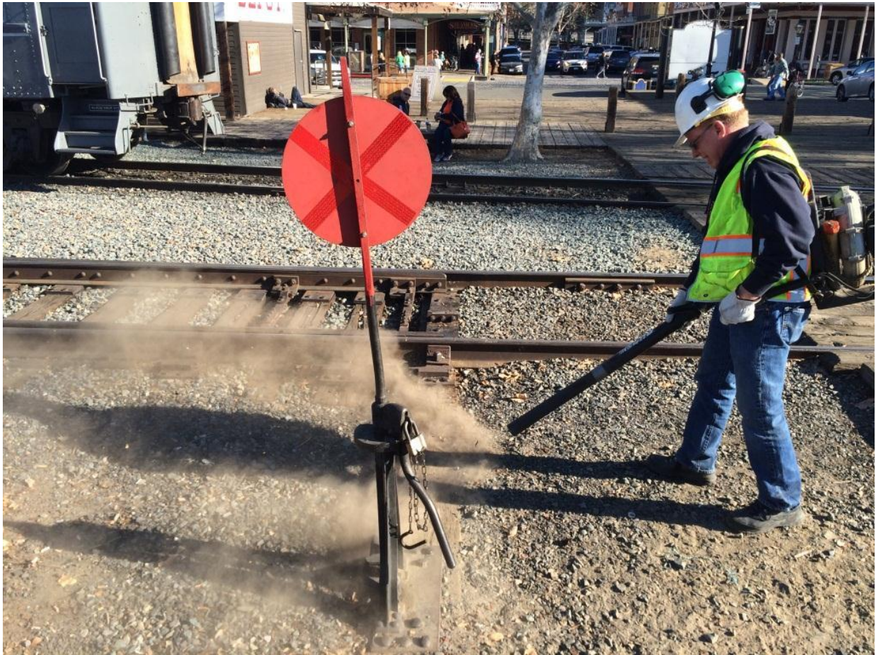
Ed uses the wind-machine to disperse debris from Switch 9.